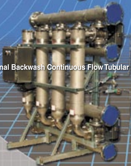
External Backwash Continuous Flow Tubular Filter