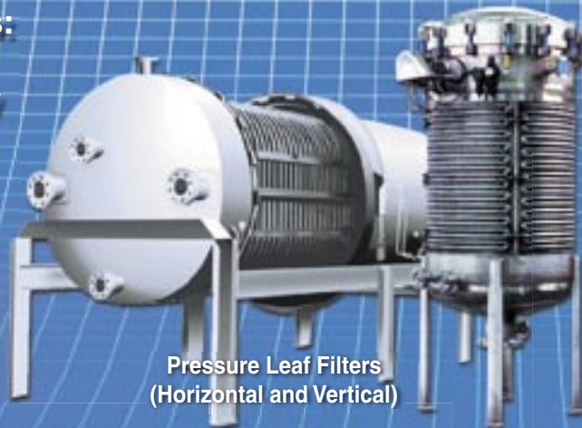
Pressure Leaf Filters (Horizontal and Vertical)