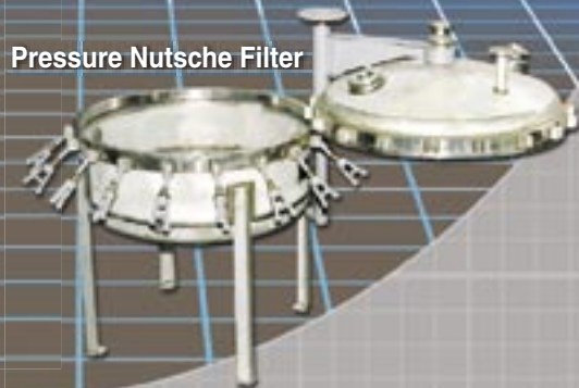
Pressure Nutsche Filter

For more information contact one of our Sales Engineers sales@howesfiltration.com howesfiltration.com