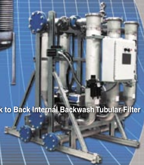
Back to Back Internal Backwash Tubular Filter